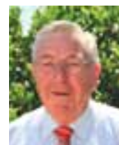
Ray Peters Residential Property Management

The Property Shop Property Management staff are committed to protecting your investment and obtaining the best possible return. Please feel most welcome to contact us for an obligation free appraisal of your rental property.