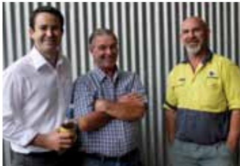
And the next function at the office will be the Landlords' Night on February 2, 2012.